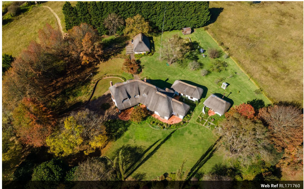
Web Ref RL171760

29 Gowie Avenue Gowie Village Nottingham Road KwaZulu Natal