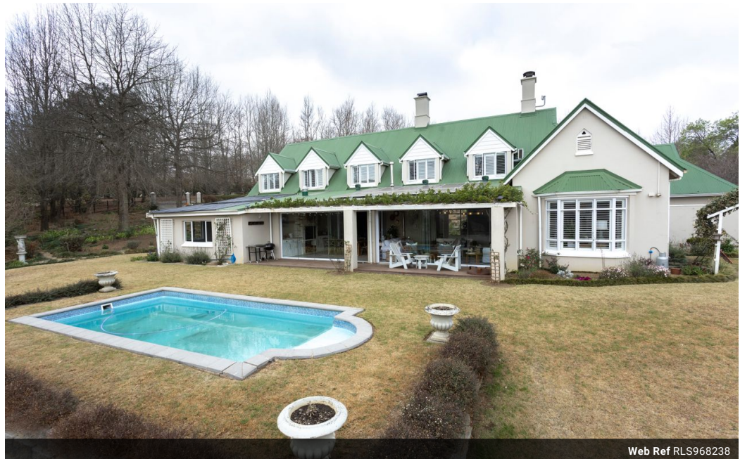
Web Ref RLS968238

29 Gowie Avenue Gowie Village Nottingham Road KwaZulu Natal