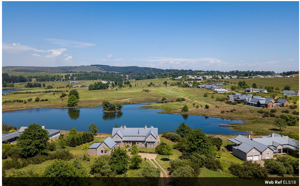
Web Ref ELS18

29 Gowie Avenue Gowie Village Nottingham Road KwaZulu Natal